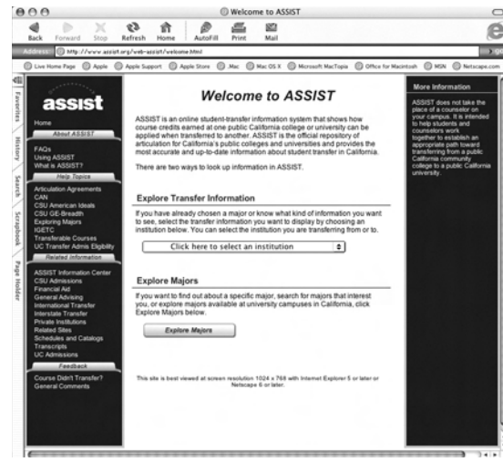
Community College/CSU/UC Transfer Course Agreements at Assist: www.assist.org