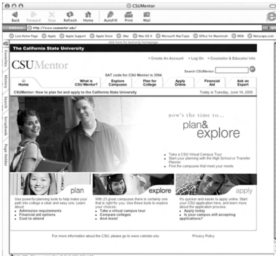
California State University Information at CSU Mentor: www.csumentor.edu